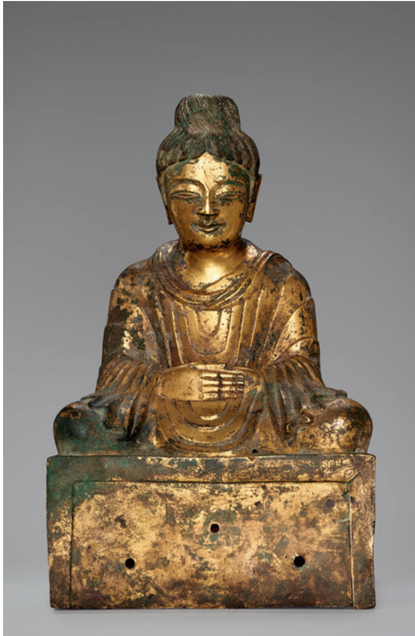
9 Seated Buddha; China, 338; gilded bronze; The Avery Brundage Collection, Asian Art Museum of San Francisco, B60B1034

buddha image dates to 338 CE (fig. 9). The Northern Wei dynasty (386–535 CE) may have been the first regional state to legally recognize Buddhism as an official religion.