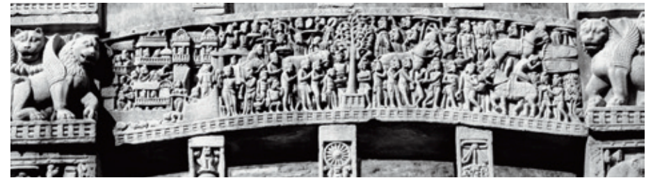
3 Sanchi Stupa no. 3; India, Madhya Pradesh, Sanchi; 2nd century BCE

these structures, known as stupas, with sculptural ornamentation, often including regional deities that had been converted into Buddhist guardians. The decoration also featured narrative scenes detailing the Buddha's life and past lives (jataka tales).